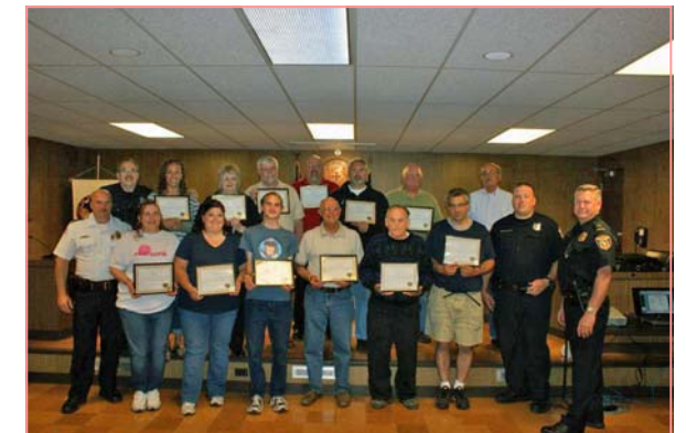
2012 Graduation Class of the SFPD Citizens Academy

Reminder, for updates and event information check the website and join us on Facebook.