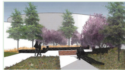
ST. FRANCIS CIVIC CENTER BUY A STONE

Our Civic Center "Buy A Stone" program kicked off at St. Francis Days and the Citizen feedback received was very positive. We have now developed a list of citizens that have requested to receive updates on the Civic Center. Contact the Mayor to be added to this list.