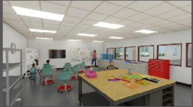
Willow Glen Elementary School Classroom Rendering

Focusing on enhancing the District's assets, the projects include comprehensive renovations and targeted addition(s) at each District school.