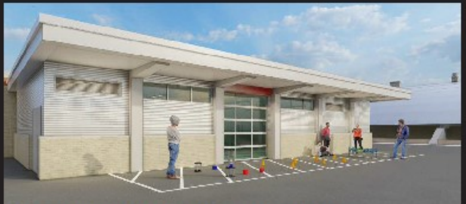
Rendering of the future STEAM addition at St. Francis High School

Improving educational spaces including STEAM-focused areas enable the District and community to excel now and in the future.