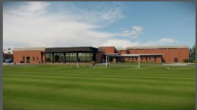
Deer Creek Intermediate School Exterior Rendering